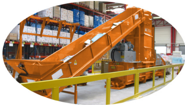
Option: conveyor belt

A completely automated waste management solution designed for continuous infeed, automatic horizontal or vertical strapping system with adjustable wire links, which enables you to yield optimal output.