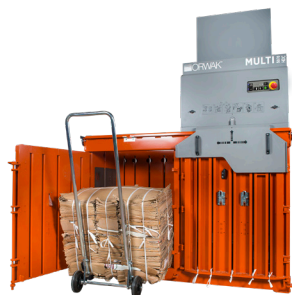
Multiple strap choice to meet both the demands of the material and tough handling requirements.

Whilst the baler compacts the material in one chamber, the other is open and ready to be fed with more material!