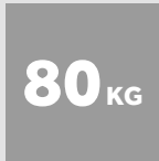
BALE WEIGHT CARDBOARD