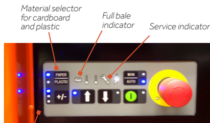
Adjustable bale size

The bales weigh up to 150 kg and are easily removed thanks to a semi-automatic bale ejection function.