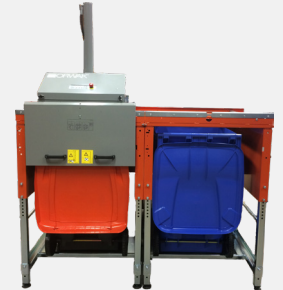
The multiple-chamber unit equipped with an apron with two handles