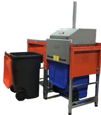
Designed to fit the standard 360 Liter bins in the market.

Safety and quality are our hallmarks and the compactor provides maximum personal safety both for the operator and those in the immediate vicinity. A bin indicator assures that the machine can only start, when the bin is in the right position.