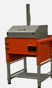
The single-chamber unit with swing door

The compactor is easily extended with additional chambers. The front door on the single-chamber unit is then replaced by an apron for effortless movement of the press head from one chamber to the next.