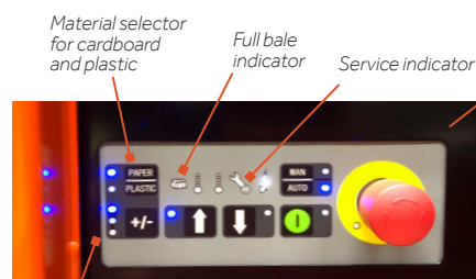
Adjustable bale size

The bales weigh up to 250 kg and are easily removed thanks to a semi-automatic bale ejection function.