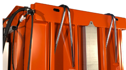
Pipes for easy bale strapping

The baler is fast and with a cycle time of just 16 sec, it is ready for a new load of cardboard boxes or plastic foil in no time and auto start is a standard feature! 3220 can be operated manually but is preferably run in auto mode for maximum productivity and convenience.