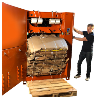
Simply push two buttons for bale ejection!