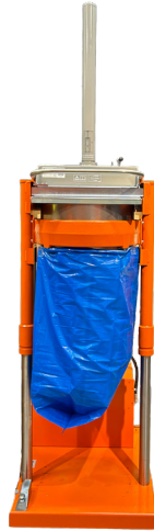
Emptying height, when the drum is hoisted, is 2660 mm with the standard B drum and only 2360 mm with the shorter C drum.

A compacted and well-sealed bag prevents leakage and odours. The machine is designed for easy daily cleaning and critical parts are made of stainless steel.