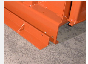
Skid mounting for bolting the machine to the floor